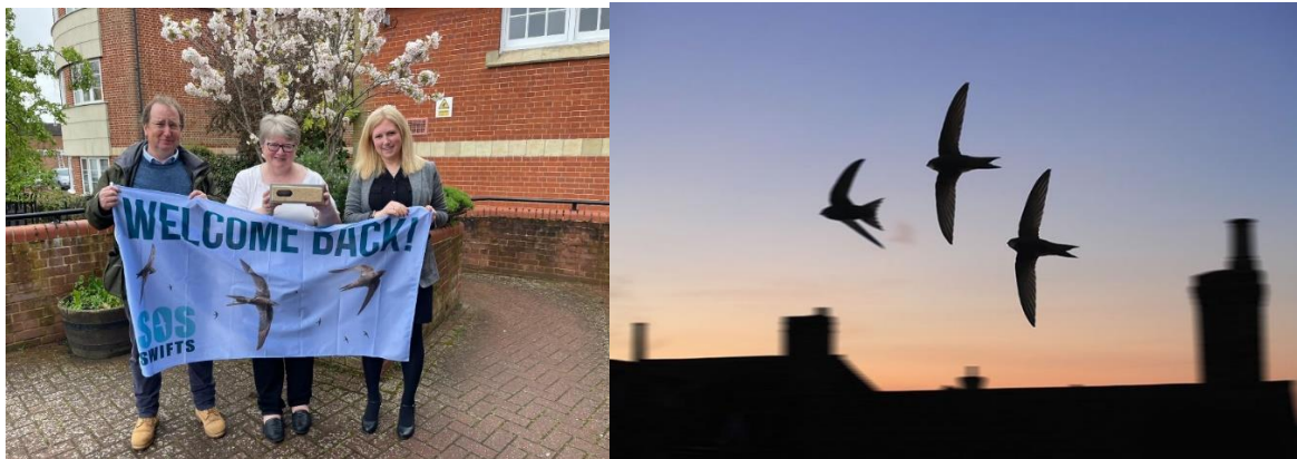
Swifts are true urban birds. Thérèse Coffey, pictured with members of the Suffolk swift conservation group, in April 2023 who supports this petition.